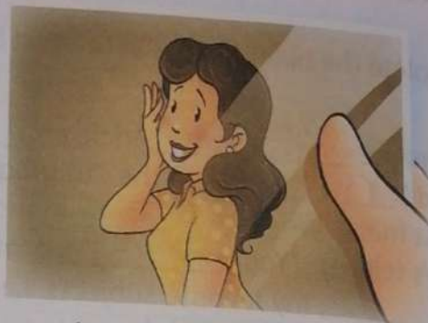
My grandma was a model at my age.