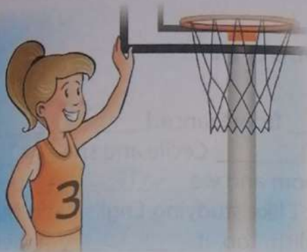
She is tall.