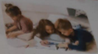
you / brothers or sisters?