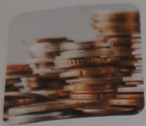
you / hobbies?