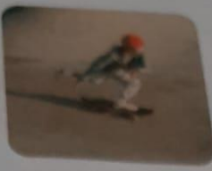
he / hobbies?