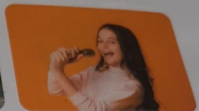
she / hobbies?