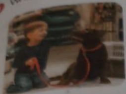
you / pets?

Write short conversations using the clues.