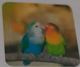
he / pets?