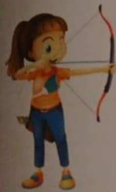
Archery Tiro con arco

1 Practice the pronunciation of the following sports.