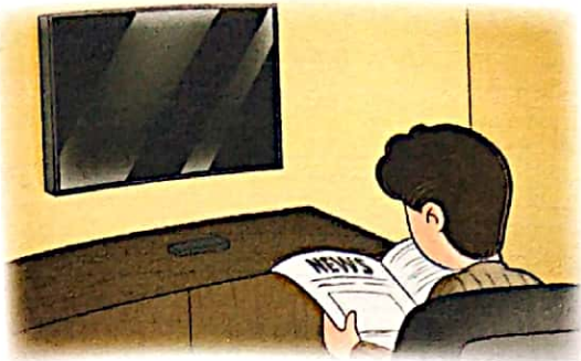
I don't often watch TV.

Subject + don't / doesn't + frequency adverb + main verb + (complement)