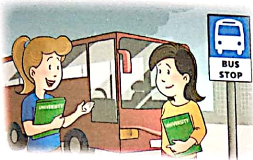
Do you always go to university by bus?

• In interrogative sentences, the frequency adverb will be placed between the subject and the main verb.