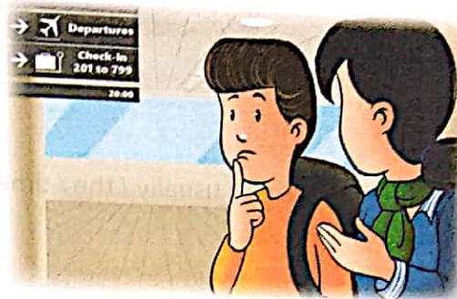
Do you usually travel?