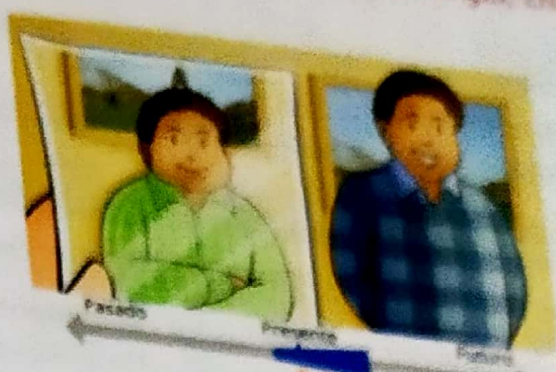
He is getting taller and thinner.