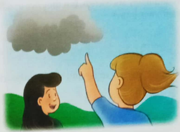
It might not be sunny tomorrow.