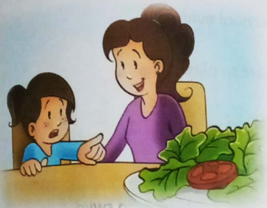
Can you pass me the salad?

can is used for actions that occur in the present or future and could for actions that occur in the past.