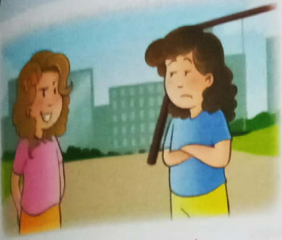
I may tell you the secret.

It is used when the speaker is unsure of an assumption he makes about the future.