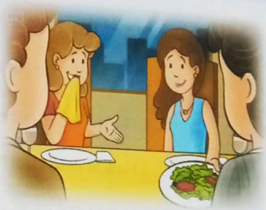
Could you pass me the salad, please?