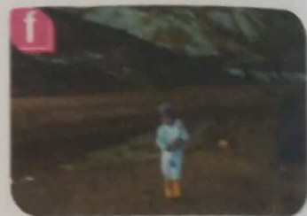
last winter went to space camp wear a space suit

a A: What did you do last summer? A: Did you see any sharks?