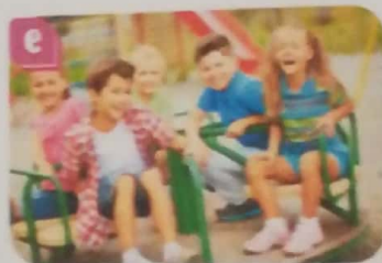
yesterday evening had fun with my friends enjoy it