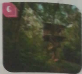
last spring built a tree house paint it