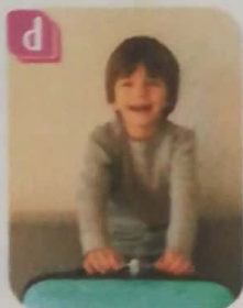
during the vacation went to Germany study German