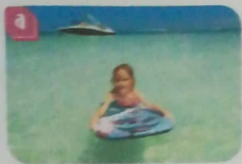
last summer learned to surf see any sharks.