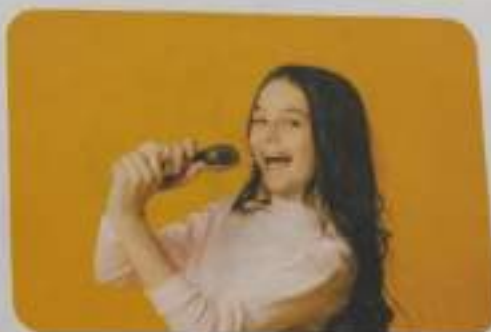
she / hobbies?