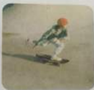
he / hobbies?