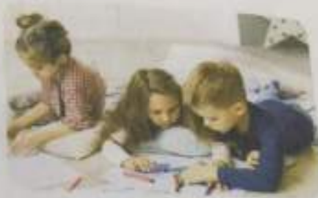
you / brothers or sisters?