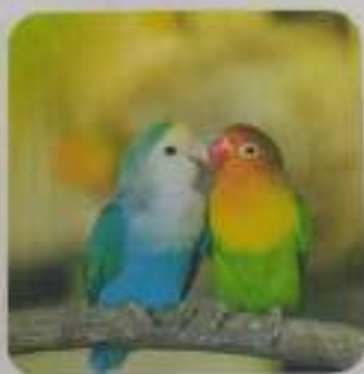
he / pets?