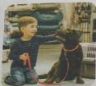
you / pets?

4 Write short conversations using the clues.