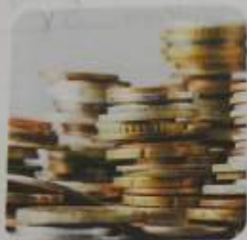
you / hobbies?