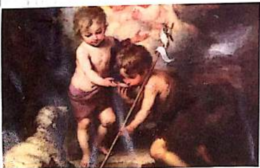
Bartolomeo Esteban Morillo (1618-1682)