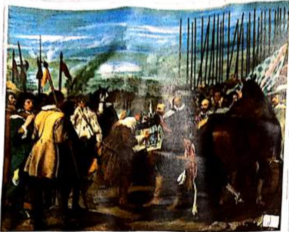
Diego Velasquez (1599 - 1660)