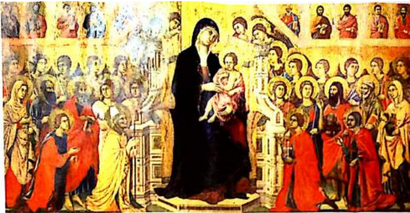
Duccio di Buoninsegna (1255 - 1319) en Italia