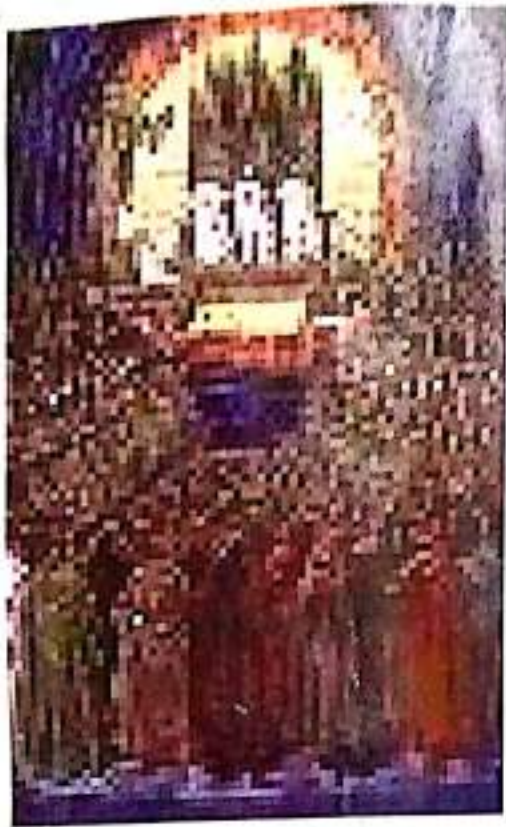
Jean Fouquet (1420-1481)