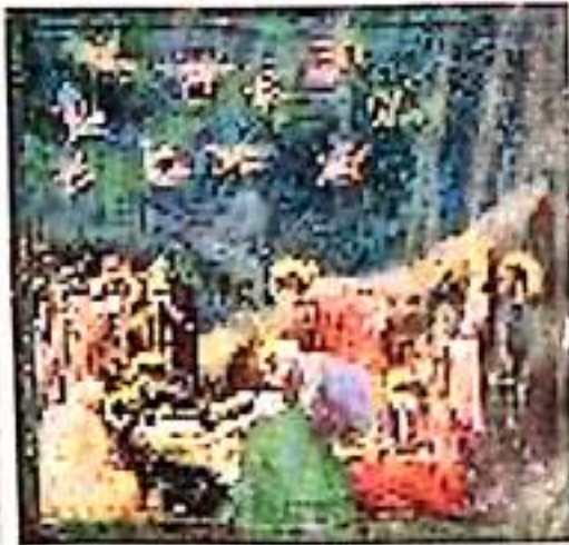
Giotto di Bondone (1267 - 1337)