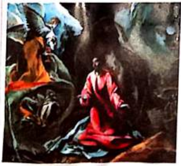
Domenico el greco (1541 - 1614)