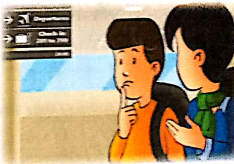
Do you usually travel?