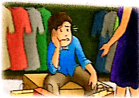
He doesn't usually go shopping.

In interrogative sentences, the frequency adverb will be placed between the subject and the main verb.