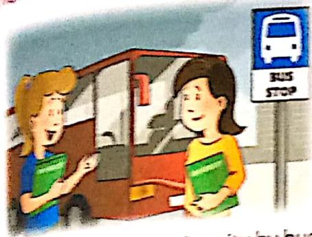
Do you always go to university by bus?

In interrogative sentences, the frequency adverb will be placed between the subject and the main verb.