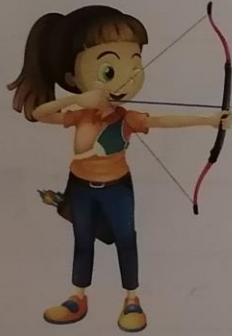
Archery Tiro con arco

1 Practice the pronunciation of the following sports.