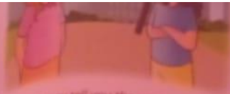
I may tell you the secret.