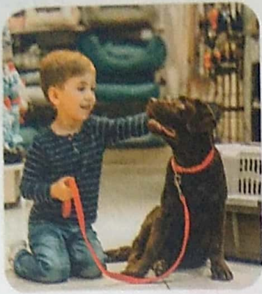
you / pets?

Write short conversations using the clues.