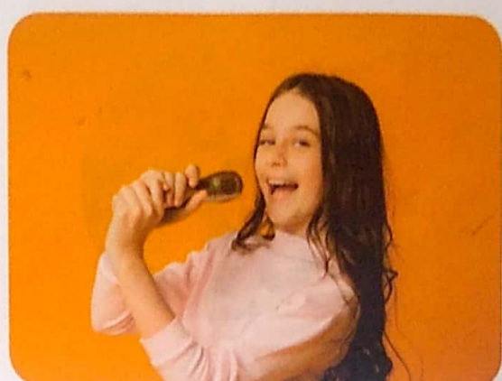
she / hobbies?