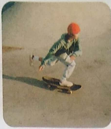
he / hobbies?