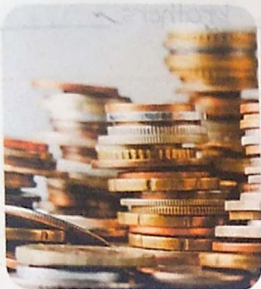
you / hobbies?