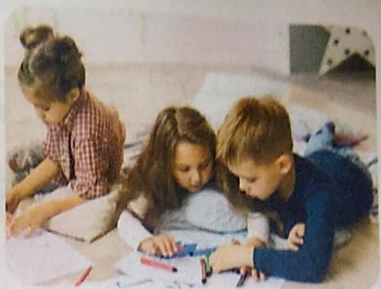
you / brothers or sisters?