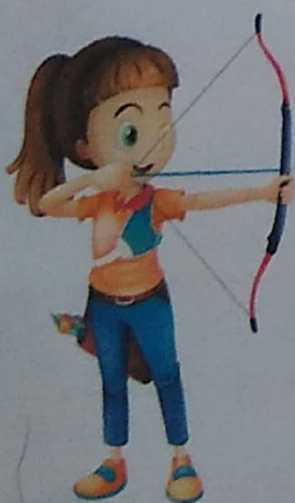
Archery Tiro con arco