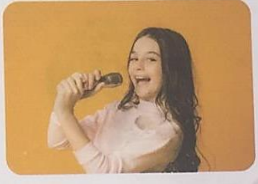
she / hobbies?