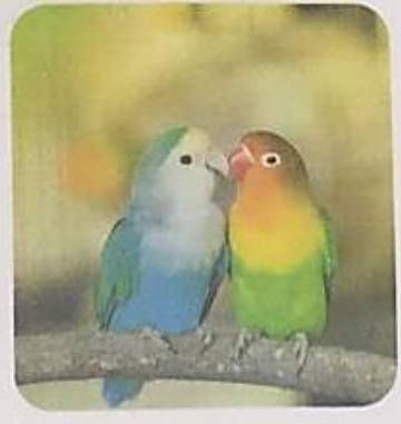
he / pets?