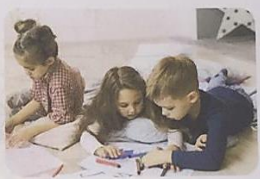
you / brothers or sisters?