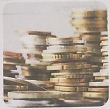
you / hobbies?