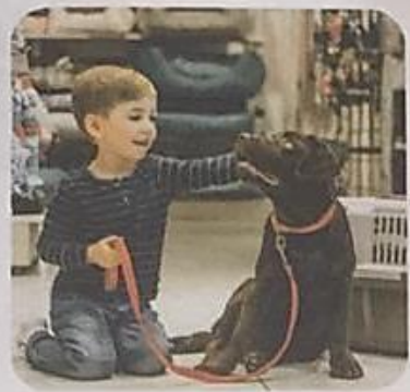
you / pets?