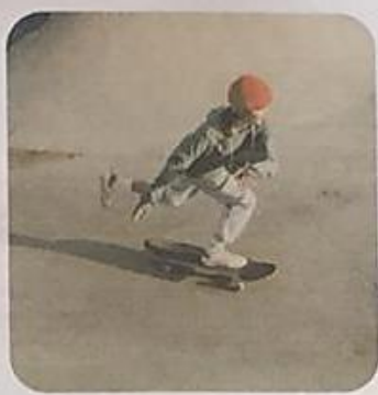
he / hobbies?