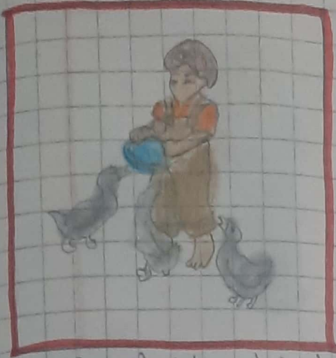
Feed the bird