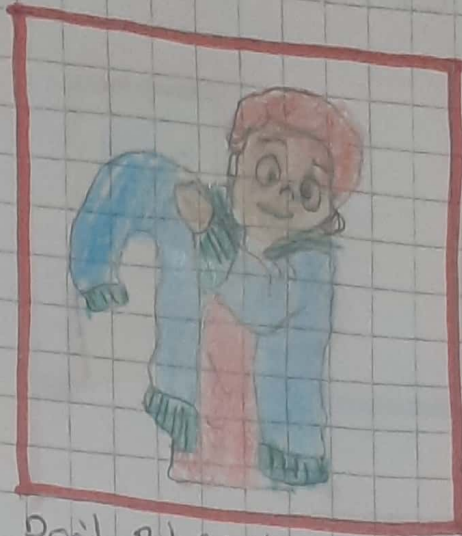
Don't put on your jacket, it's hot.