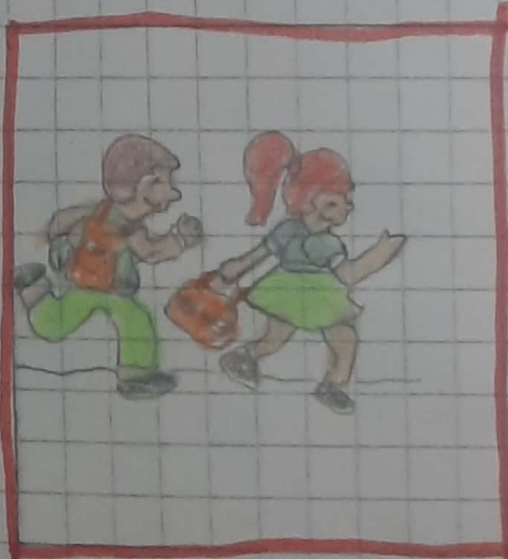
let's go to class, it's eight o'clock