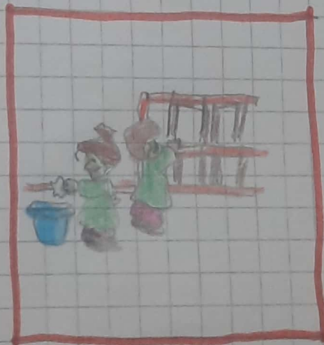
tidy your bedroom