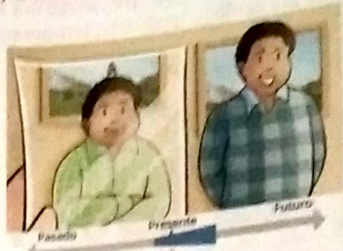
He is getting taller and thinner.