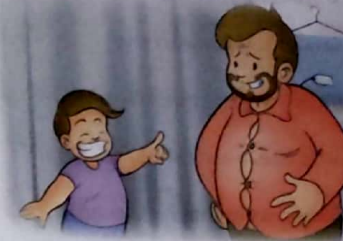
This shirt doesn't fit me, does it?