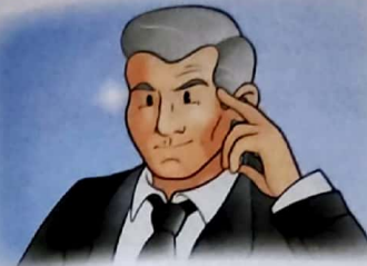
Pierce Brosnan is Irish, isn't he?