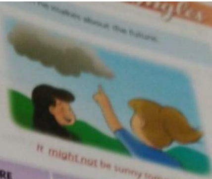
It might not be sunny tomorrow.