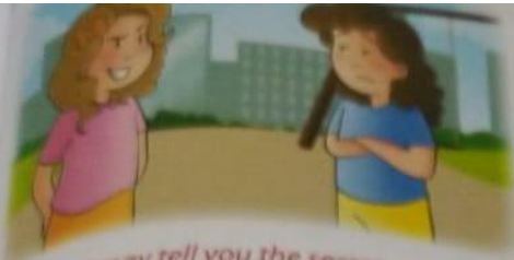
I may tell you the secret.