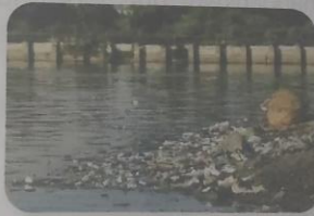
green house oils